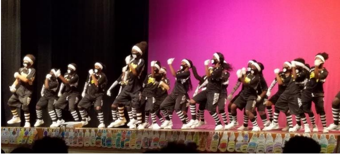
(Ruediger students performing at Lights On; choreographed by Imani Dance)

On Thursday, October 26, 2017, fourteen (14) different 21 st CCLC sites came together to celebrate their Afterschool Programs! Over 600 attendees came out to help celebrate the event. The attendees included: staff, students, parents, families, vendors and partners! All of the students did an amazing job showcasing their programs and participating in the performances. Thank you to everyone that assisted and played a role in the success of the program! We appreciate each of you!