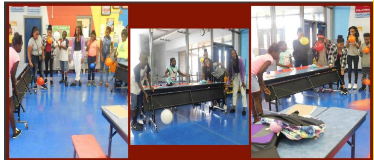
Fairview students experimenting with Rocket Balloons.